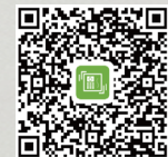
Android QR Code

D2 Tabletop Terminal is specially designed for table or counter use (80-140cm). With fingerprint sensor placed on top of terminal, it enables all-directional fingerprint reading for the convenience of attendance. BioID high sensitivity fingerprint sensor provides faster and more accurate fingerprint verification. With built-in detachable battery lasting for up to 8 hours, and micro-USB power supply for power bank (minimum 2A) connection, there are no more worries for lacking power sockets supply.