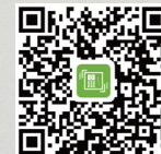
IOS QR Code