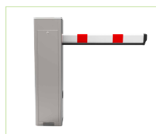
PB Series Automatic Barrier