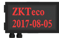
LPR-Display Screen (Optional)