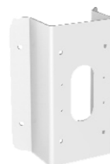
DS-1476ZJ-Y Corner Mount