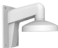
DS-1473ZJ-155-Y Pendant Mount