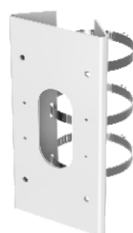
DS-1475ZJ-Y Vertical Pole Mount