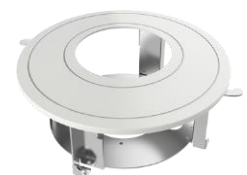
DS-1227ZJ-DM42 In-Ceiling Mount