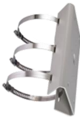
DS-1275ZJ-SUS Vertical Pole Mount