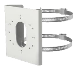
DS-1275ZJ-S-SUS Vertical Pole Mount