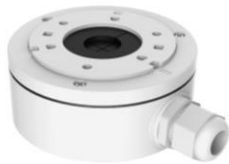
DS-1280ZJ-XS Junction Box