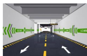
Entrance & Exit